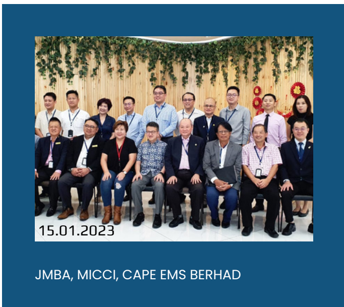
JMBA, MICCI, CAPE EMS BERHAD

Making a difference in this nation building is everyone's hope now. We are truly glad that we can be part of the historical change-making journey in this city, Johor Bahru, where we call it our homeplace.